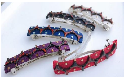
Laquer Tsugaru accessories