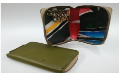
Leather goods "Neputa"